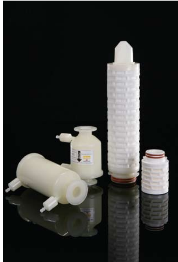
Note: PEPLYN is a registered trademark of Parker domnick hunter