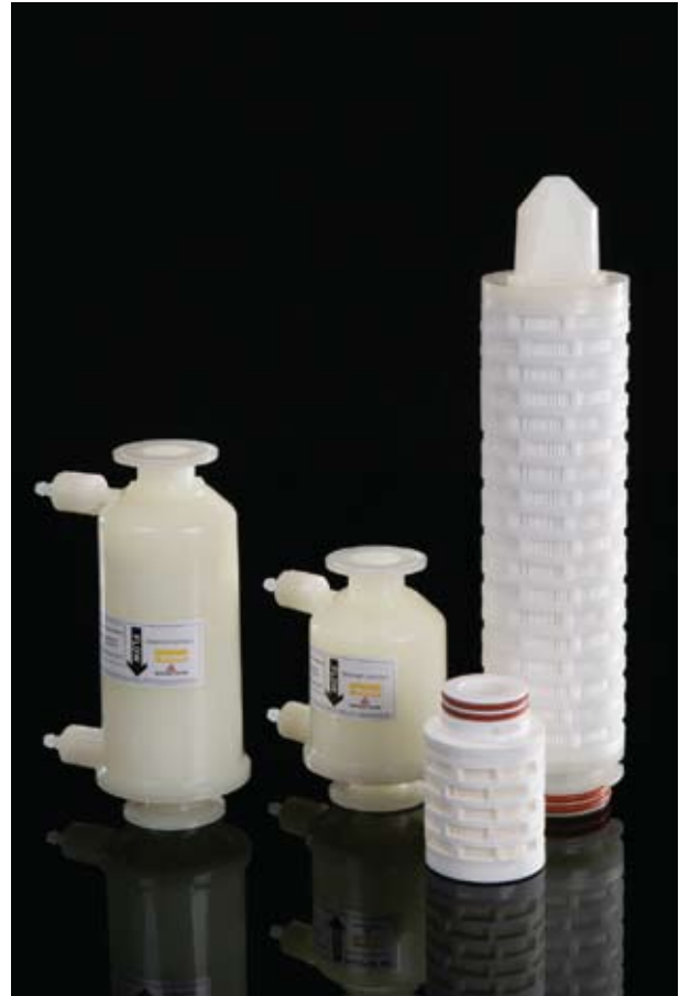
Note: BEVPOR is a registered trademark of Parker domnick hunter